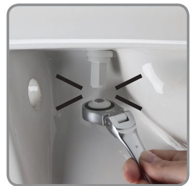
Snap to Secure