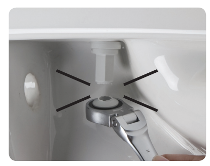
3) Snap to Secure