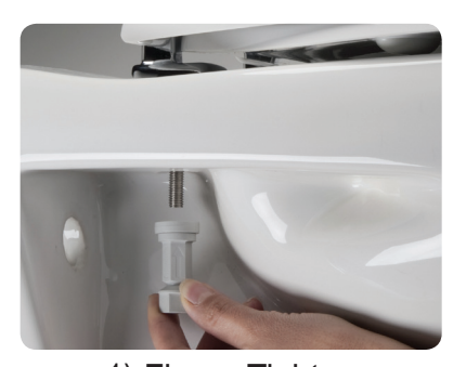
1) Finger Tighten