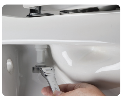
2) Tighten with Spanner