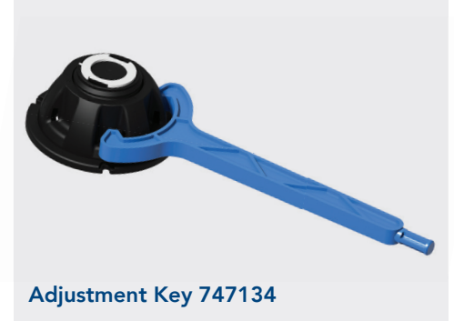
Adjustment Key 747134