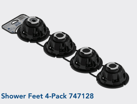
Shower Feet 4-Pack 747128