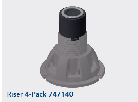
Riser 4-Pack 747140